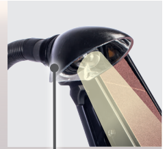
Sanding disc dressing unit