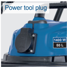
Power tool plug