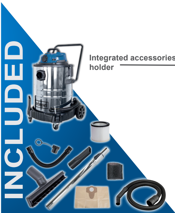
50 L steel container