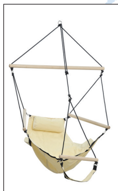
Sand • AZ-2030560 EAN 4030454000871