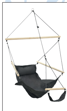
Black • AZ-2030580 EAN 4030454000505