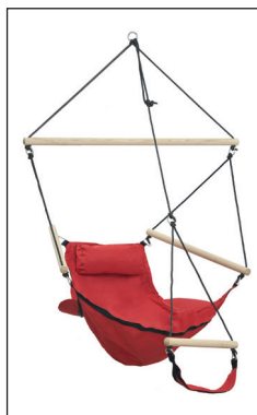
Red • AZ-2030520 EAN 4030454000857