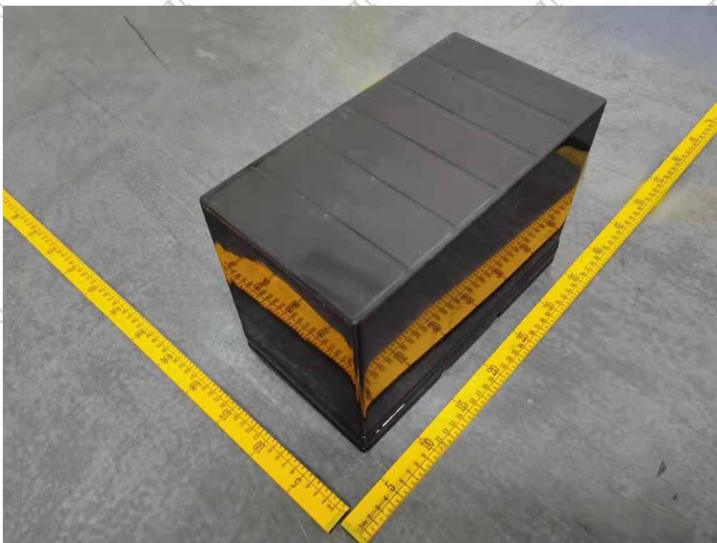
Figure 2 Overall view II of battery (电池外观图II)