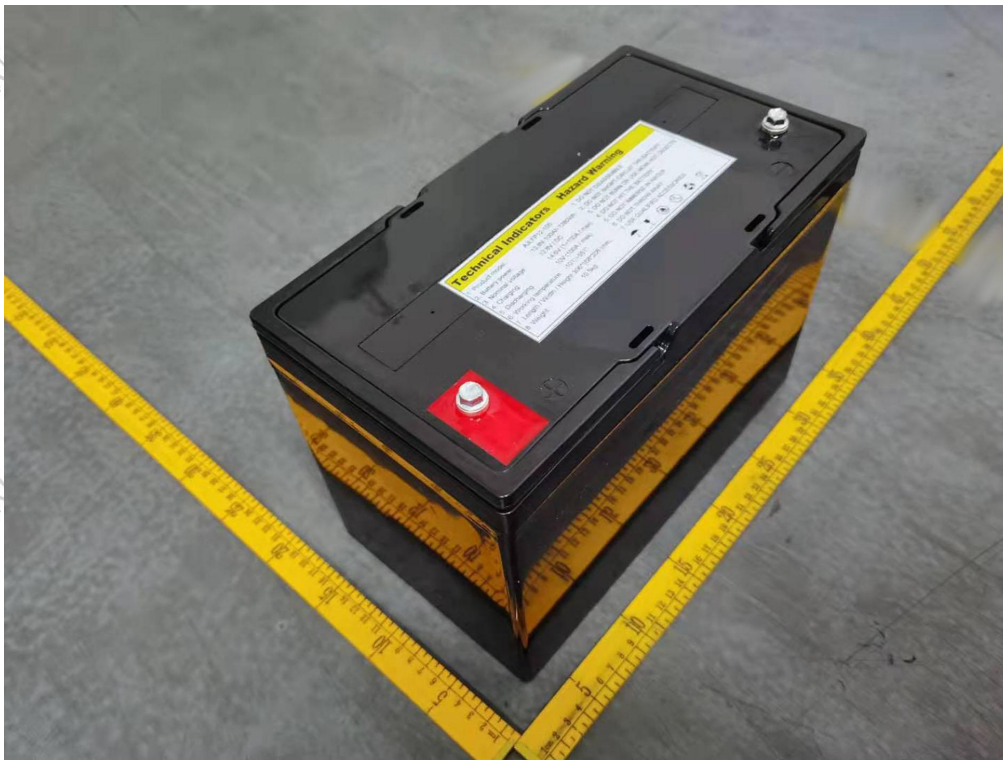
Figure 1 Overall view I of battery (电池外观图I)