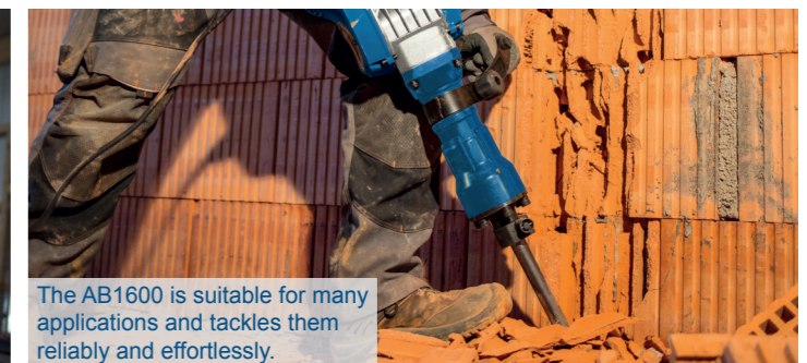
The AB1600 is suitable for many applications and tackles them reliably and effortlessly.