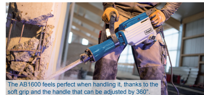
The AB1600 feels perfect when handling it, thanks to the soft grip and the handle that can be adjusted by 360°.