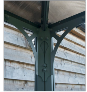
Stylish & durable structure