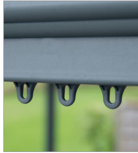
Curtain hangers included