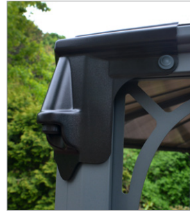
Integrated gutter & gutter heads