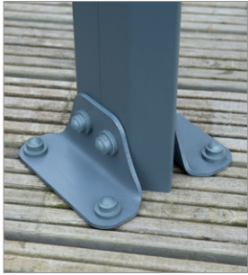
Anchoring & foot-pads kit included