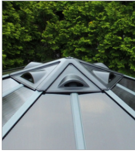
Elegant top vent detail