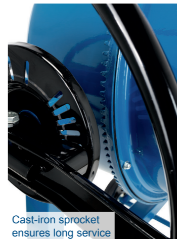
Cast-iron sprocket ensures long service