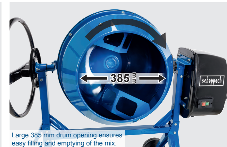
Large 385 mm drum opening ensures easy filling and emptying of the mix.