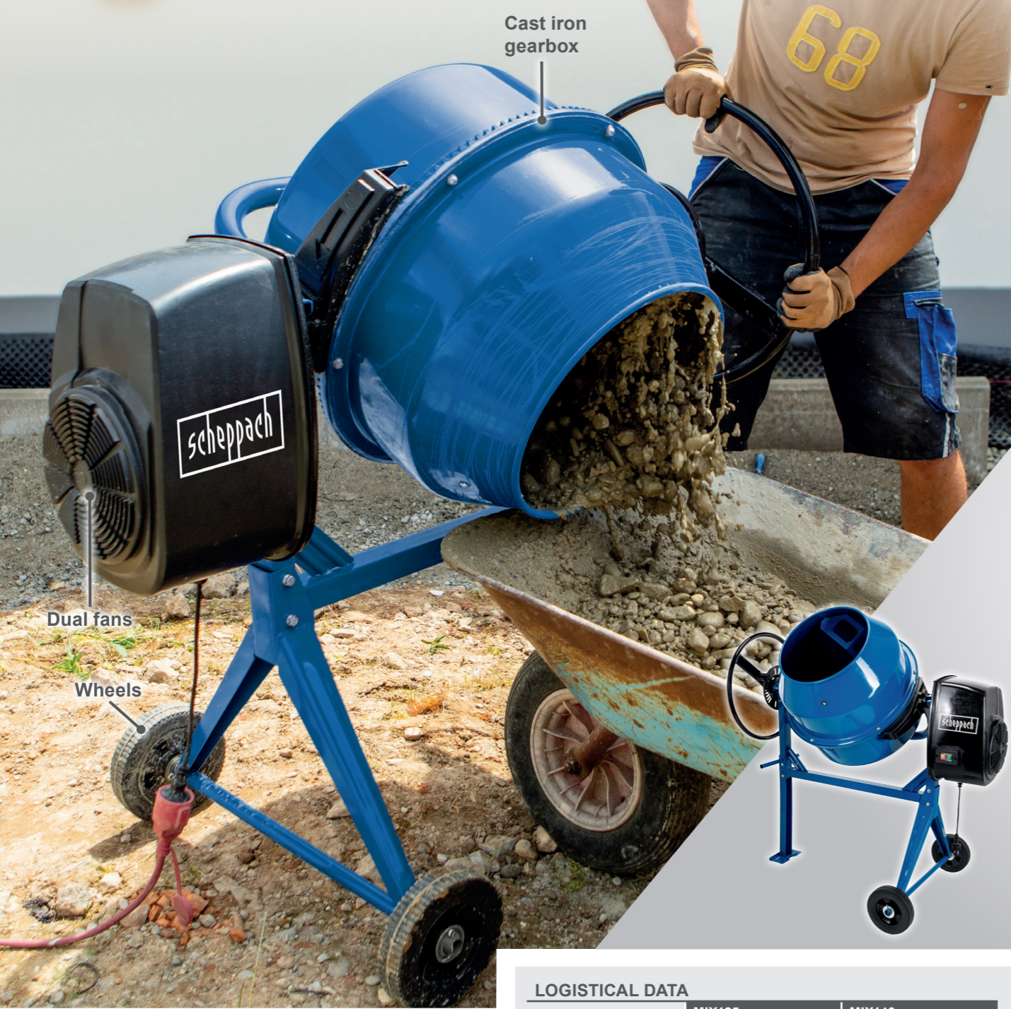
Cast iron gearbox