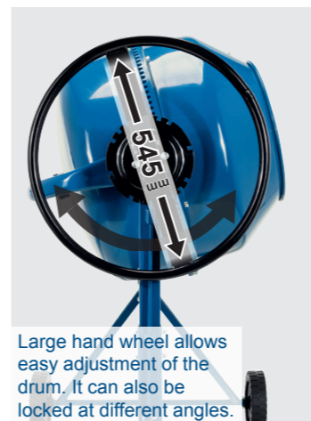
Large hand wheel allows easy adjustment of the drum. It can also be locked at different angles.