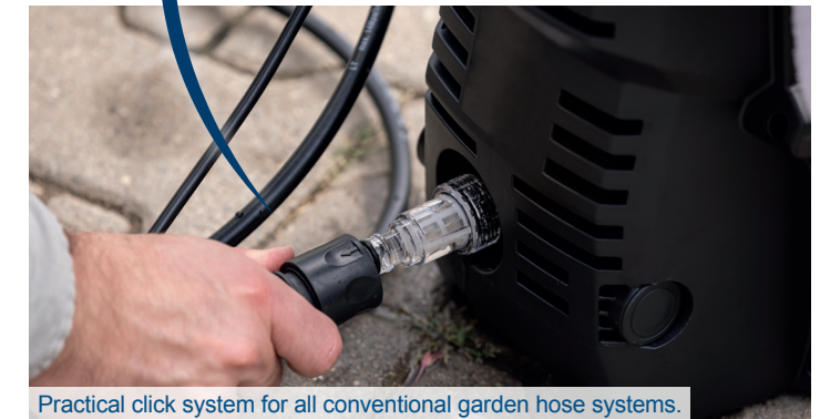
Practical click system for all conventional garden hose systems.