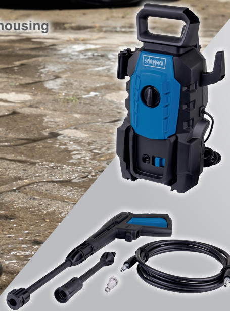
3 m high-pressure hose