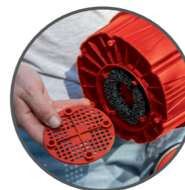
Integrated dirt filter easy to clean