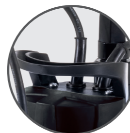
Easy to transport, thanks to carrying handle