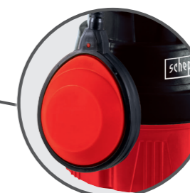
Float switch to protect from running dry