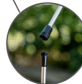
No need for tools thanks to practical screw fasteners