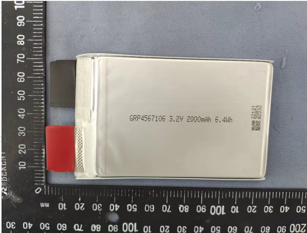
Figure 3 Overall view of cell (电芯外观图)