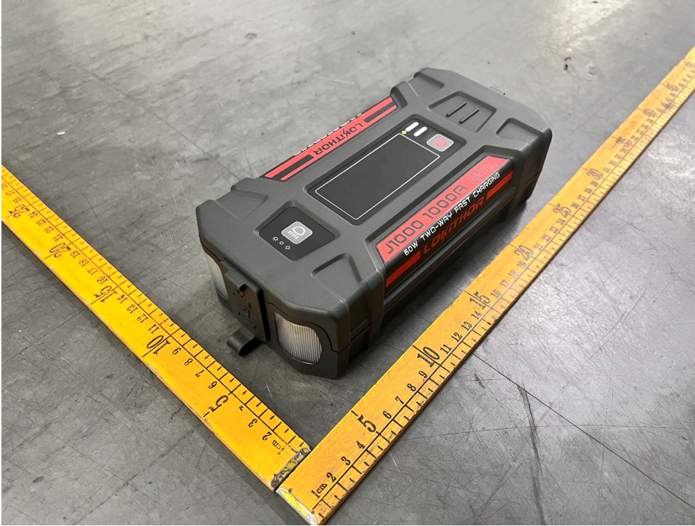
Figure 1 Overall view I of battery (电池外观图I)