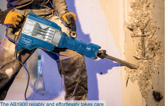
The AB1900 reliably and effortlessly takes care of heavy-duty demolition work.