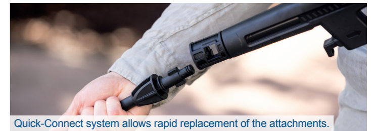
Quick-Connect system allows rapid replacement of the attachments.