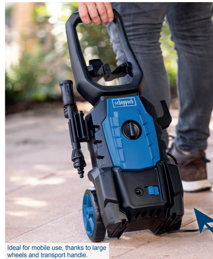
Ideal for mobile use, thanks to large wheels and transport handle.