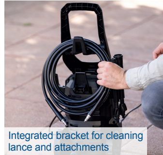
Integrated bracket for cleaning lance and attachments