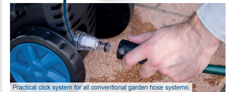
Practical click system for all conventional garden hose systems.