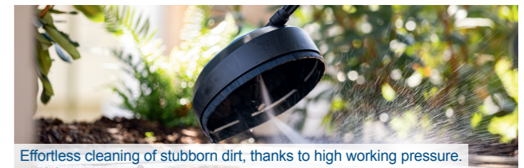
Effortless cleaning of stubborn dirt, thanks to high working pressure.