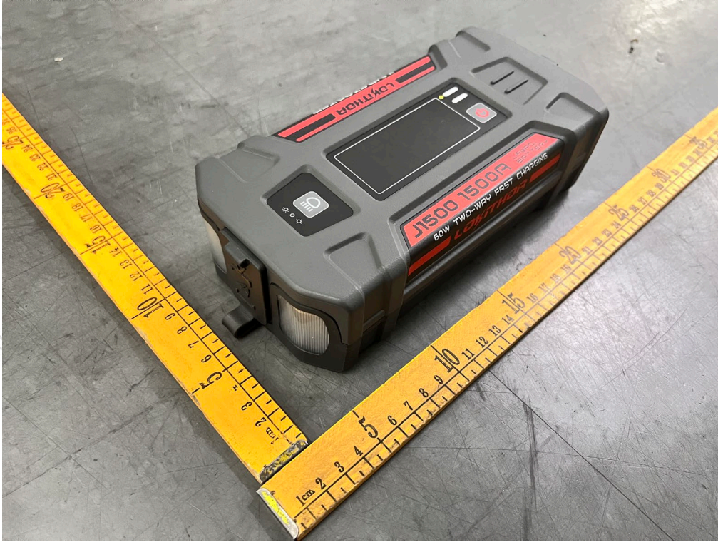
Figure 1 Overall view I of battery (电池外观图I)