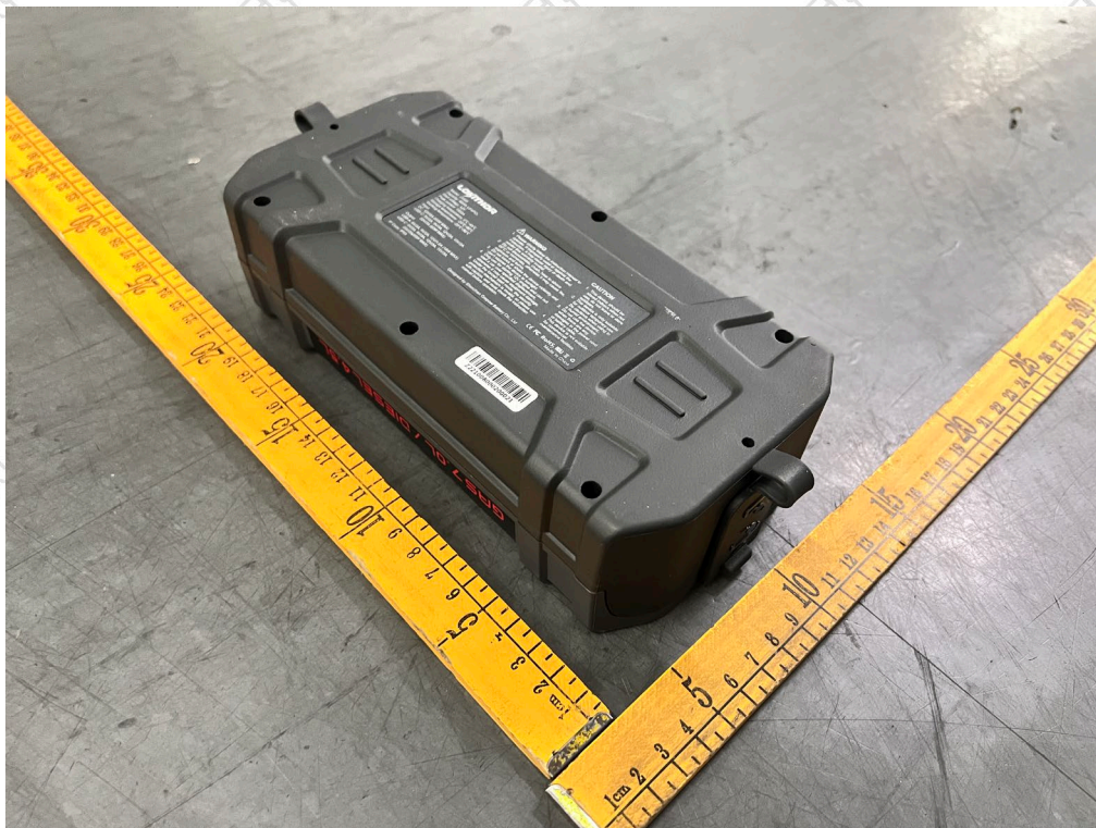
Figure 2 Overall view II of battery (电池外观图II)